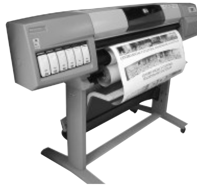
Fig. 1.6 Plotter

Plotter is a device that draws pictures on paper based on commands from a computer. Plotters differ from printers in that they draw lines using a pen. As a result, they can produce continuous lines, whereas printers can only simulate lines by printing a closely spaced series of dots. Multicolour plotters use different-coloured pens to draw different colours.