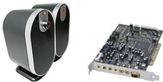
Fig. 1.7 Sound Card and Speakers