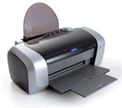
Fig. 1.5 Ink-jet Printer

Because ink-jet printers require smaller mechanical parts than laser printers, they are specially popular as portable printers. In addition, colour ink-jet printers provide an inexpensive way to print full-colour documents.