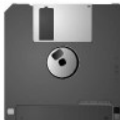
Fig. 1.4 Floppy Diskette

It is similar to magnetic disk discussed above. It is 3.5 inch in diameter. The capacity of a 3.5 inch floppy is 1.44 mega bytes. It is cheaper than any other storage devices and is portable. The floppy is a low cost device particularly suitable for personal computer system.